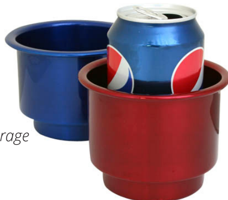
SS Beverage Holder

A stainless steel rim tops these beverage holders, making them look great even in the day time. The removable rubber insert keeps your cans, bottles and cozies secure and insulated.