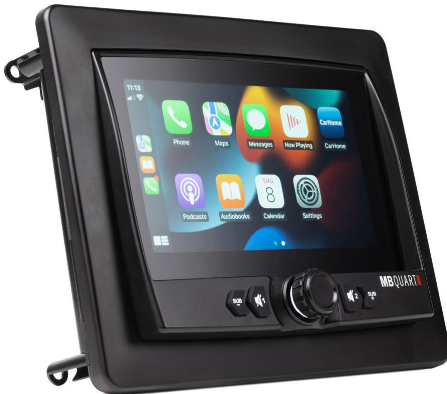
MB Quart GMR7V1 7-inch waterproof touchscreen CarPlay source unit (shown above)

With deeper features like an integrated four-button auxiliary switching system, easy-to-use and simple navigation, and protection against the conditions with it being completely waterproof - the GMR7V1 is the next evolution of source units from MB Quart. Bringing more control and integration with your iPhone or Bluetooth device, the GMR7V1 waterproof CarPlay source unit uses a master knob control button for easy navigation of options and sub-level buttons within a full touchscreen 7-inch display.