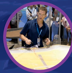
Experienced Technical Support