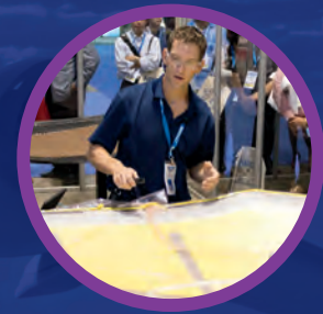
Experienced Technical Support